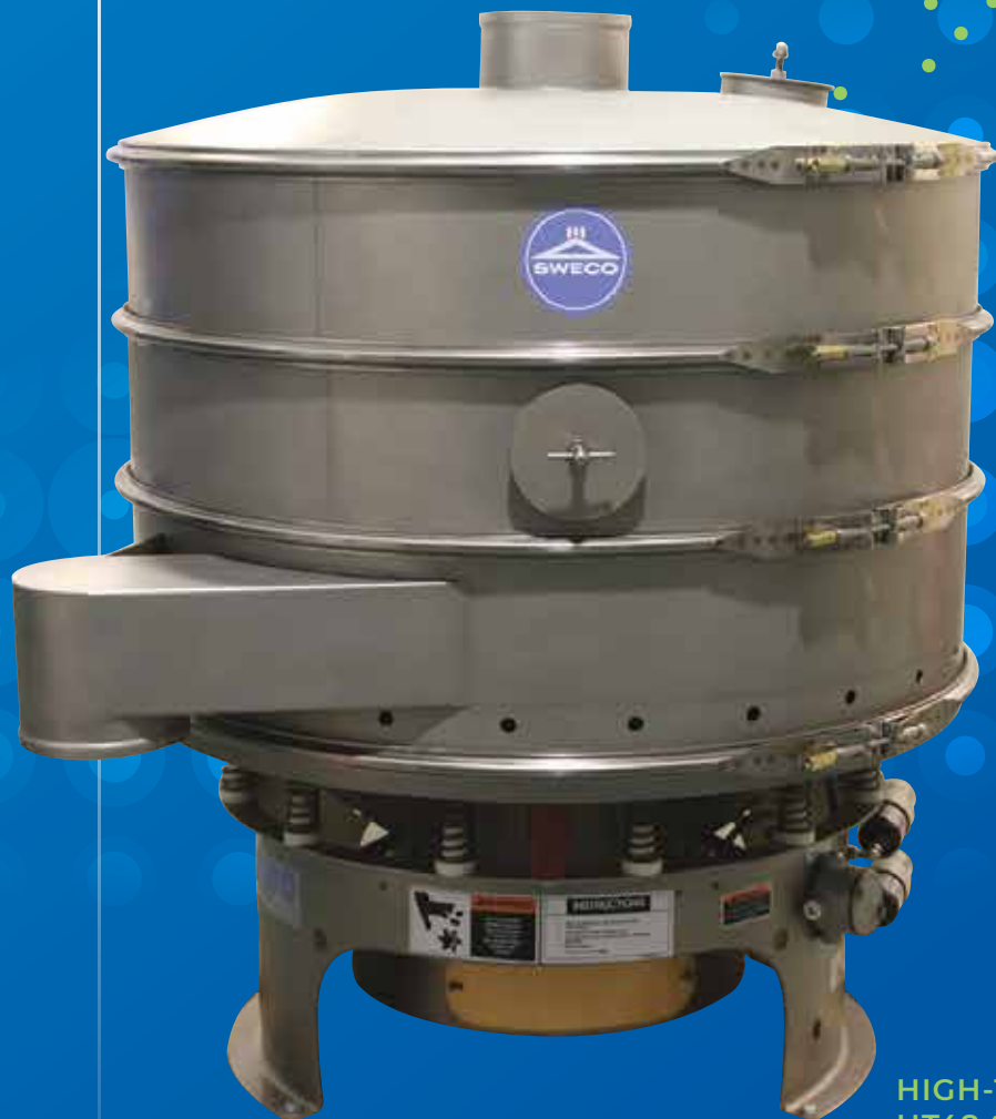
HIGH-TEMP HT48 SEPARATOR

MANUFACTURED TO WITHSTAND CONDITIONS FOR APPLICATIONS INVOLVING HIGH TEMPERATURE MATERIALS